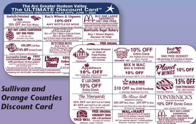
Sullivan and Orange Counties Discount Card

As our way of thanking you, every local member receives a DISCOUNT CARD offering 27 year-long discounts at area merchants in either Sullivan and Orange Counties or Poughkeepsie and Dutchess County and beyond, to use over and over until June 2022. Your card will be mailed to you when we receive your membership form. Lifetime Members' cards will be mailed automatically each year.