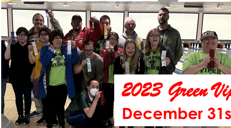
2023 Green Vipers Luncheon December 31st; 11am-3pm