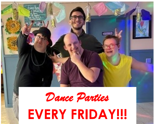
Dance Parties EVERY FRIDAY!!!