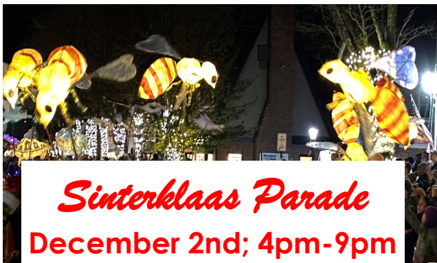
Sinterklaas Parade December 2nd; 4pm-9pm