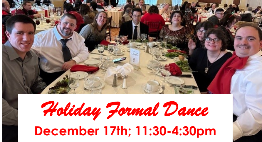
Holiday Formal Dance December 17th; 11:30-4:30pm