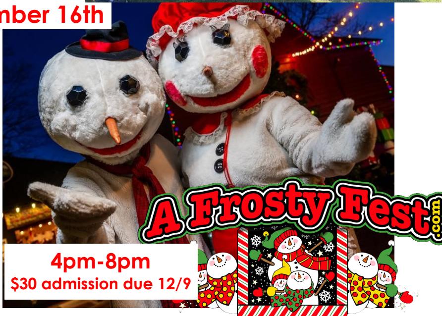
4pm-8pm $30 admission due 12/9